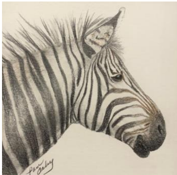
'Striped Pajama' By Pam Caley (Graphite Pencil)